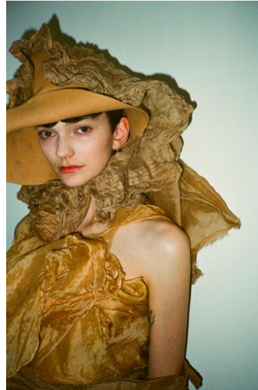
8. Dirty Looks Paolo Carzana, Spring/Summer 2025 Ready-to-Wear How to Attract Mosquitoes .