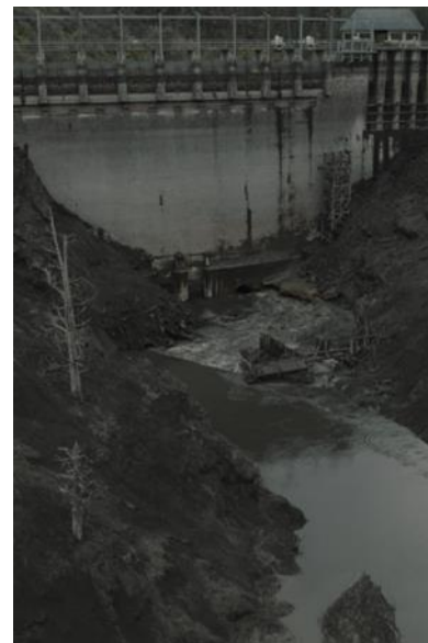
10. Lucy Raven: Rounds Lucy Raven, Murderers Bar , 2025, production still from moving image installation, Courtesy of the Artist and Lisson Gallery, © Lucy Raven