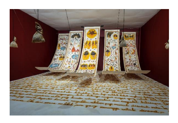
Installation view of Citra Sasmita, Timur Merah Project: The Embrace of My Motherland, 2019, as part of Biennale Jogja XV, Yogyakarta, 2019. Courtesy Biennale Jogja, Yogyakarta. © Citra Sasmita