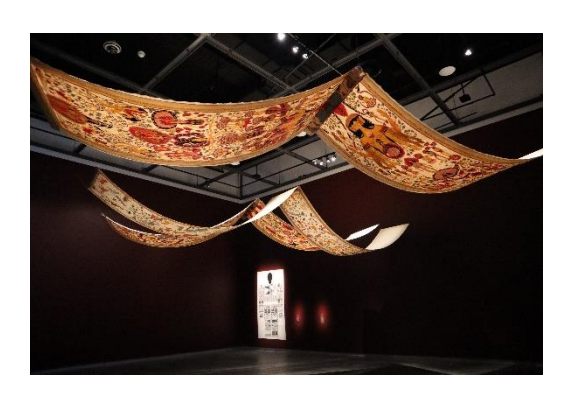
6. Installation view of Citra Sasmita, Timur Merah Project X: Bedtime Story , 2023, as part of the Biennale of Sydney, 2024. © Citra Sasmita