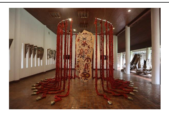
9. Installation view of Citra Sasmita, Mae Fah Luang Art & Cultural Park, Thailand Biennale, Chiang Rai 2023: The Open World , 9 December 2023–30 April 2024. Courtesy Thailand Biennale Chiang Rai 2023. © Citra Sasmita