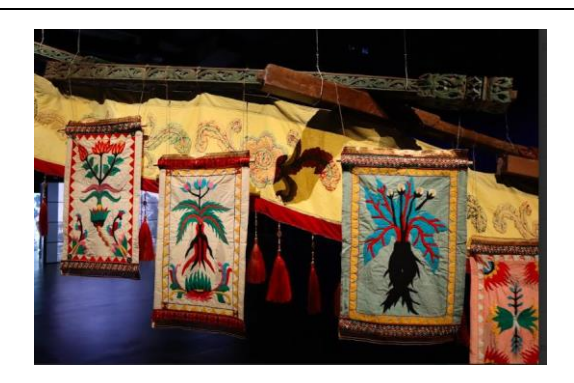
8. Installation view of Citra Sasmita, Timur Merah Project XII: Rivers With No End , as part of After Rain , Diriyah Contemporary Art Biennale, 2024 Courtesy of the Diriyah Biennale Foundation Photo: Marco Cappelletti © Citra Sasmita