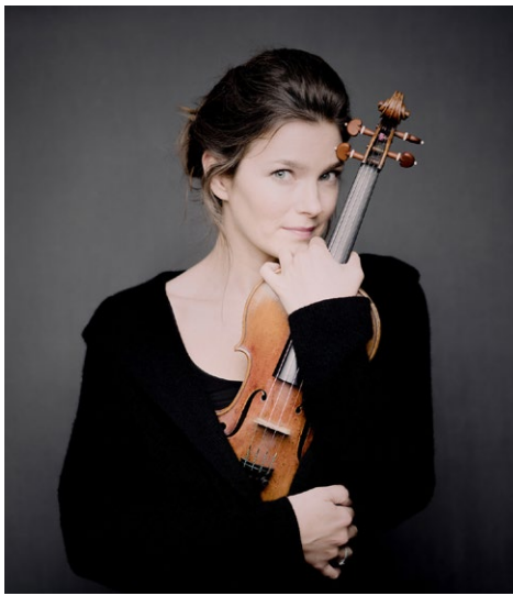
↑ Janine Jansen