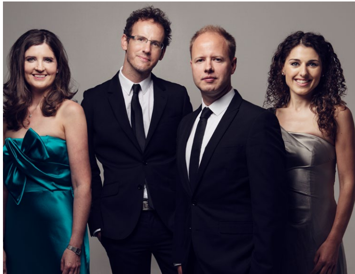
← Carducci Quartet