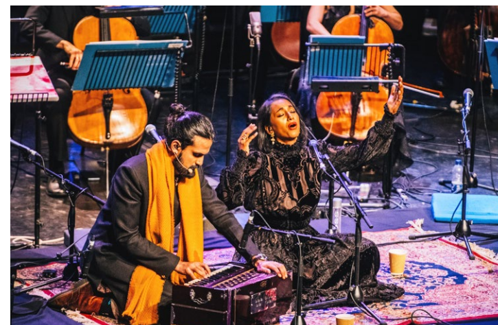
→ The Orchestral Qawwali Project