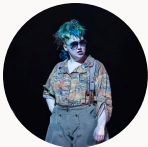
ROBIN Goodfellow, also known as Puck, a sprite in the service of Oberon