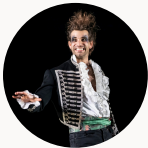
OBERON King of the fairies