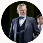
EGEUS Father to Hermia