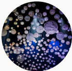
PEASEBLOSSOM, COBWEB, MOTH and MUSTARDSEED Represented by colourful orbs