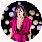
TITANIA Queen of the fairies