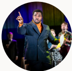
PHILOSTRATE An official in Theseus' court