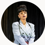
HIPPOLYTA Queen of the Amazons, betrothed to Theseus