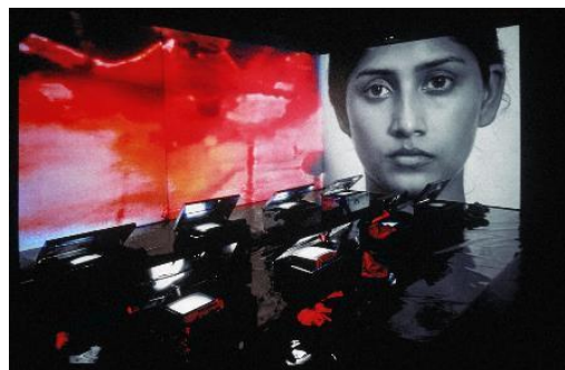
16. The Imaginary Institution of India: Art 1975-1998 Nalini Malani, Remembering Toba Tek Singh, 1998 Installation view, World Wide Video Festival, Amsterdam, 1998