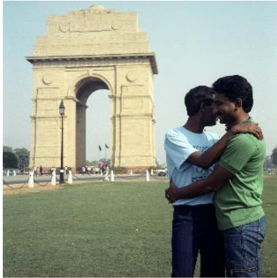
India Gate Don't look back, don't look forward just look at the monument. 1987. 100 x 100 cm