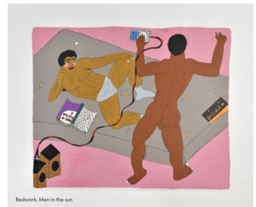
Bedwork, Men in the sun