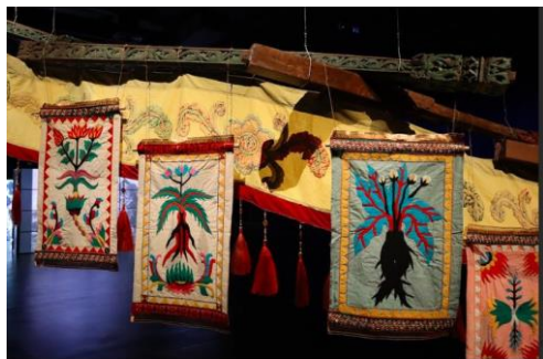
9. Citra Sasmita: Into Eternal Land Installation view of Citra Sasmita, Timur Merah Project XII: Rivers With No End , as part of After Rain , Diriyah Contemporary Art Biennale, 2024