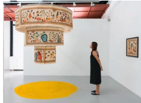
8. Citra Sasmita: Into Eternal Land Installation view of Citra Sasmita, Ode to the Sun , Yeo Workshop, Singapore, 2020