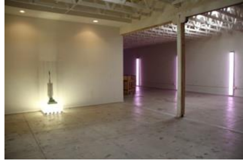
6. Noah Davis Installation view, Noah Davis: Imitation of Wealth , The Underground Museum, 2013 © The Estate of Noah Davis