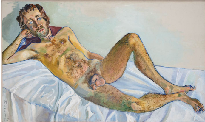
© The Estate of Alice Neel