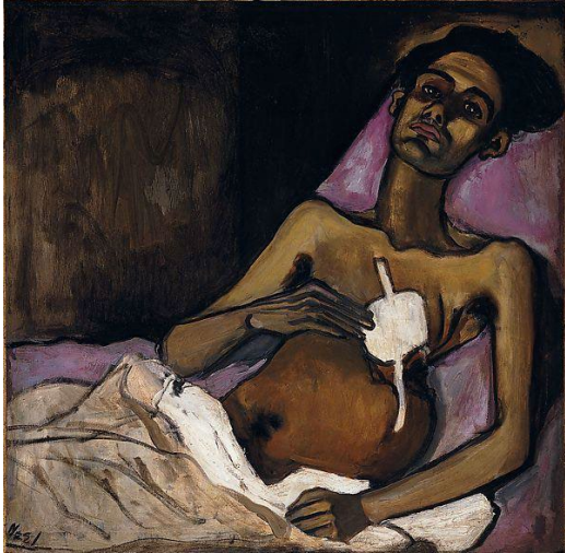
© The Estate of Alice Neel