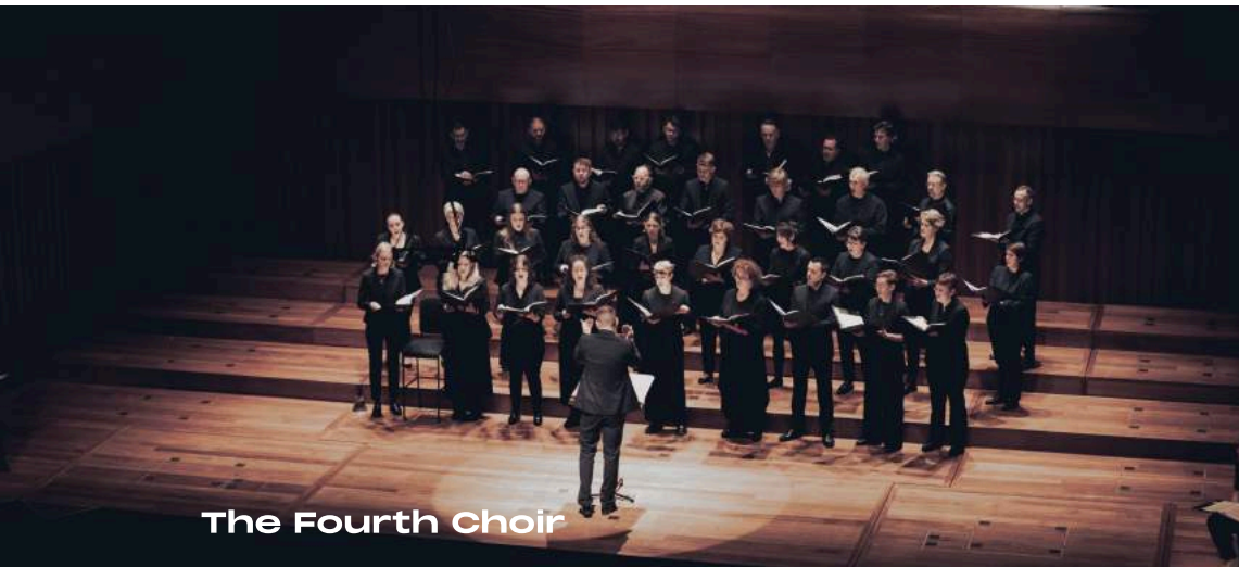
The Fourth Choir