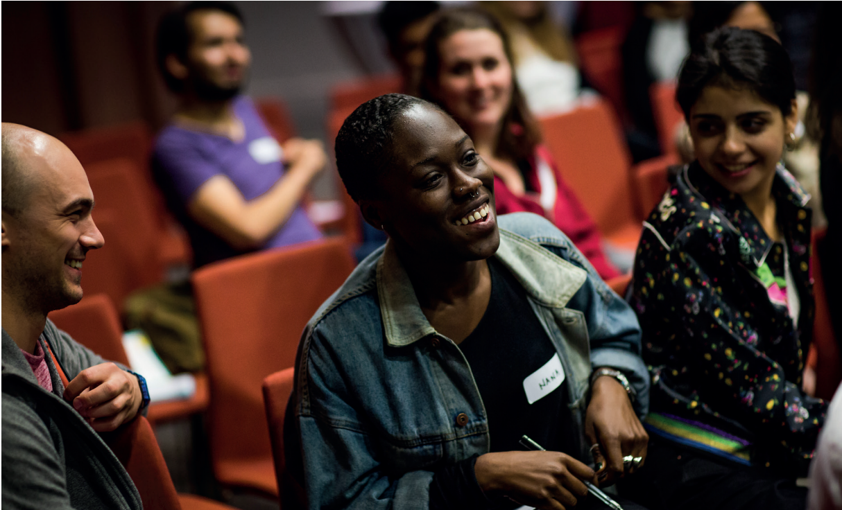
Creative Careers session: The Pitch Masterclass, Barbican Frofishers 1 & 2, July 2017