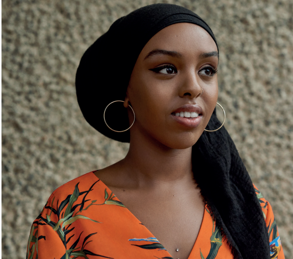
Warehouse X Barbican: Inside Out photoshoot, Barbican Centre

In addition to welcoming high-street retailer Warehouse as a Barbican Business Member this year, the fashion brand also delivered an inspiring event for our Creative Careers programme, which gave young people valuable insight into how fashion shoots are put together and advice on developing a career in the industry. The brand developed a hugely popular range of clothing inspired by the Barbican's iconic architecture, tropical conservatory and concrete textures, which was sold in Warehouse stores across the UK.