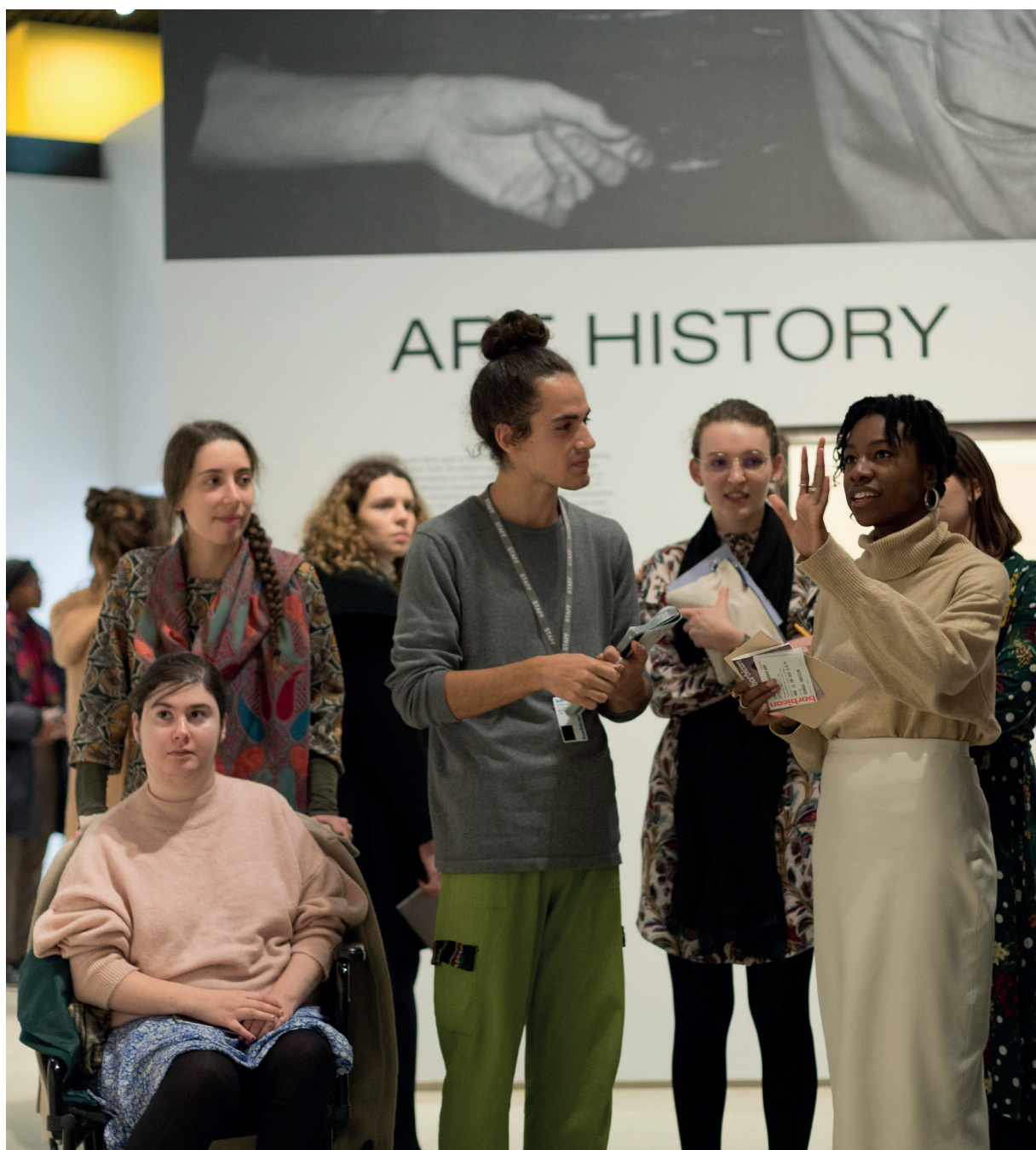
Young Barbican Private View of Basquiat: Boom for Real, Barbican Art Gallery, 15 Jan 2018, © Catarina Rodrigues

During the year, the Trust received grants and donations of £921,787 (2017: £796,908). These comprised donations totalling £534,804 (2017: £502,923) which were restricted to specific activities and unrestricted donations totalling £386,983 (2017: £293,8985). Here are highlights of some of the programmes and projects made possible by supporters and partners this year (p8–14):