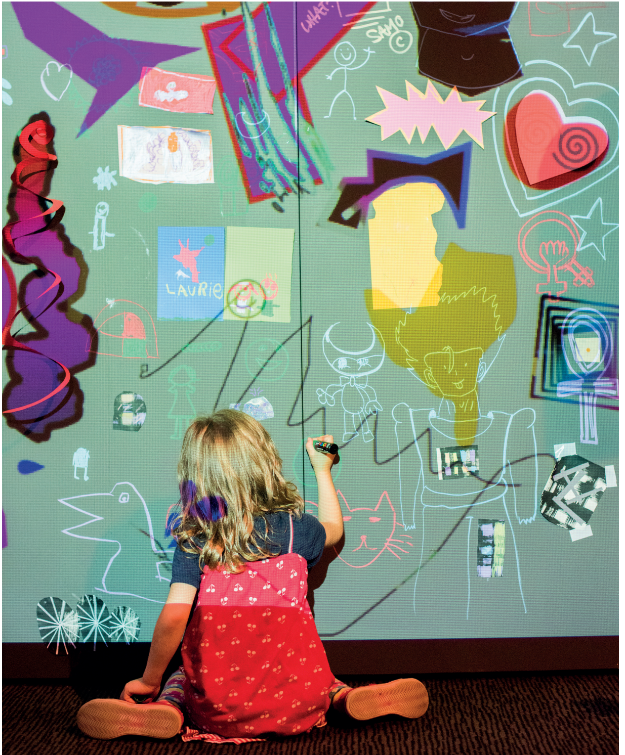
Too Young for What? A day of free public activities to celebrate the creativity of Jean-Michel Basquiat, Barbican Foyers, 7 Oct 2017