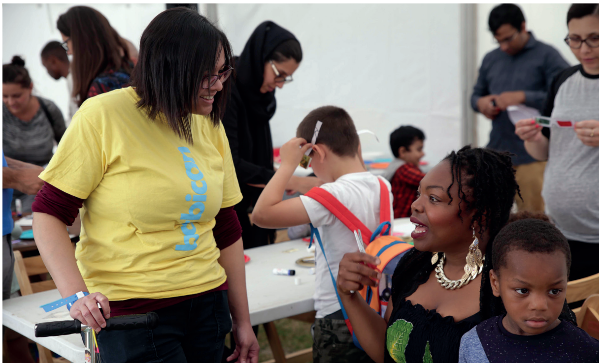
Barbican Community Ambassador at Leyton Carnival, July 2017

The Barbican Centre Trust continues to support the Barbican’s mission to inspire more people to discover and love the arts. Last year, income raised through the Trust contributed to a number of audience development initiatives.