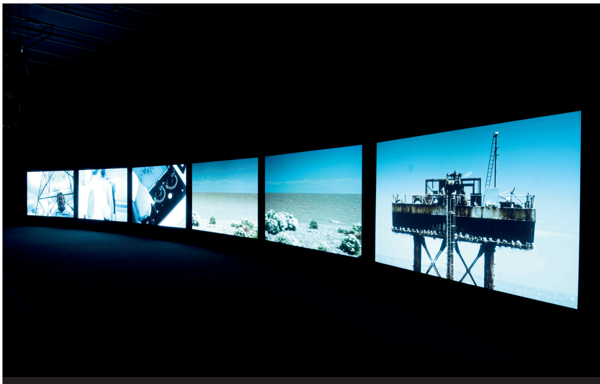
Christie Digital projection, John Akomfrah: Purple Installation, The Curve, Barbican Centre, 06 October 2017 – 07 January 2018