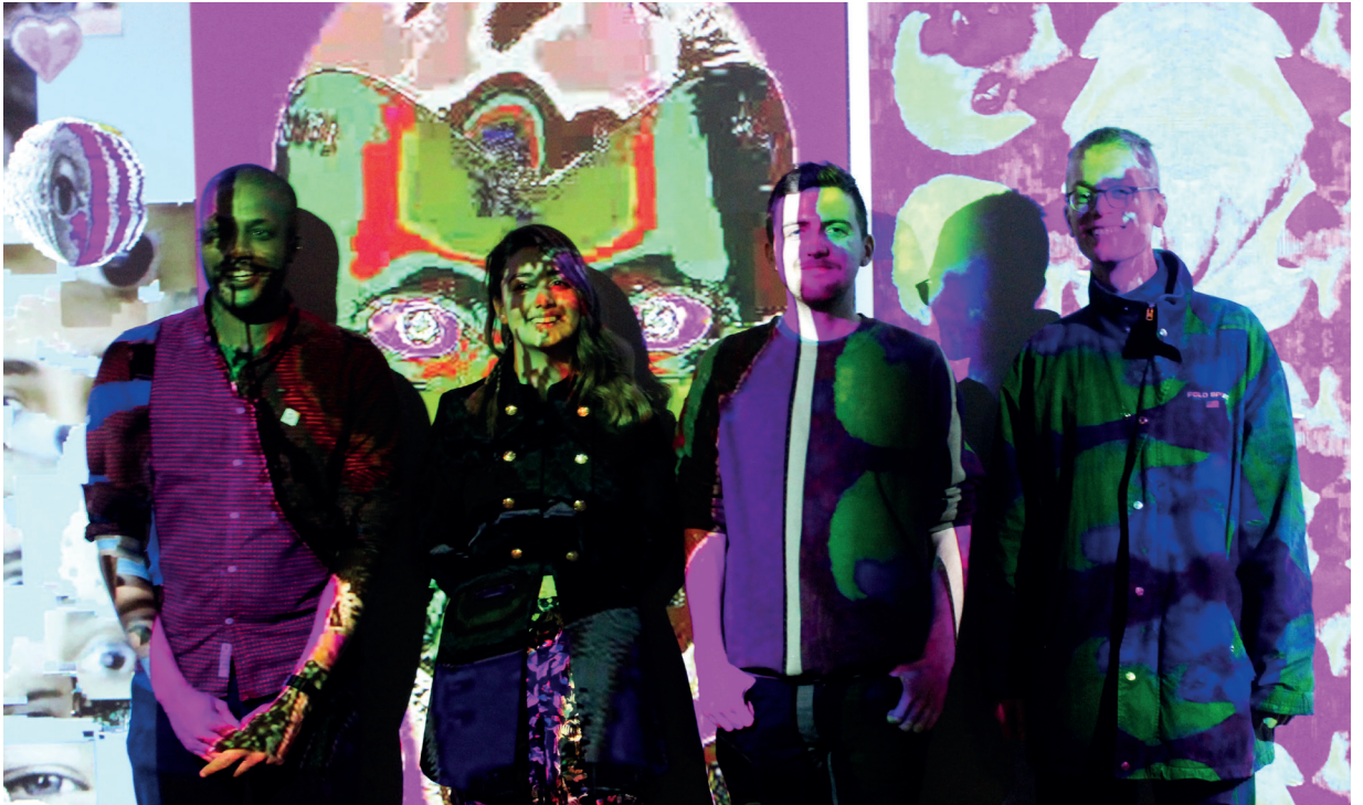
Barbican young creatives pose in front of the installation Basquiat's Brain , Level G, Barbican Centre, © Antonio Roberts