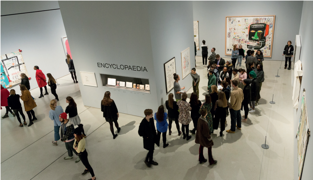
Young Barbican Private View of Basquiat: Boom for Real, Barbican Art Gallery, 15 Jan 2018

'Crucially, all money donated to the Barbican's Visual Arts programme allows us to continue to present ambitious, risk-taking work. Basquiat was a case in point. Support of the exhibition from generous individuals and sponsors enabled its lead curator to make research trips to the United States – giving her a forensic understanding of the artist's work and creating the opportunity to build deeper relationships with lenders. Support contributed to the production of the exhibition catalogue, which helped us create an outstanding publication that became our bestselling catalogue ever. Elsewhere, our events programme was funded by a generous grant from the Cockayne Foundation – this resulted in us being able to bring an impressive array of leading experts from the US to discuss Basquiat's work'