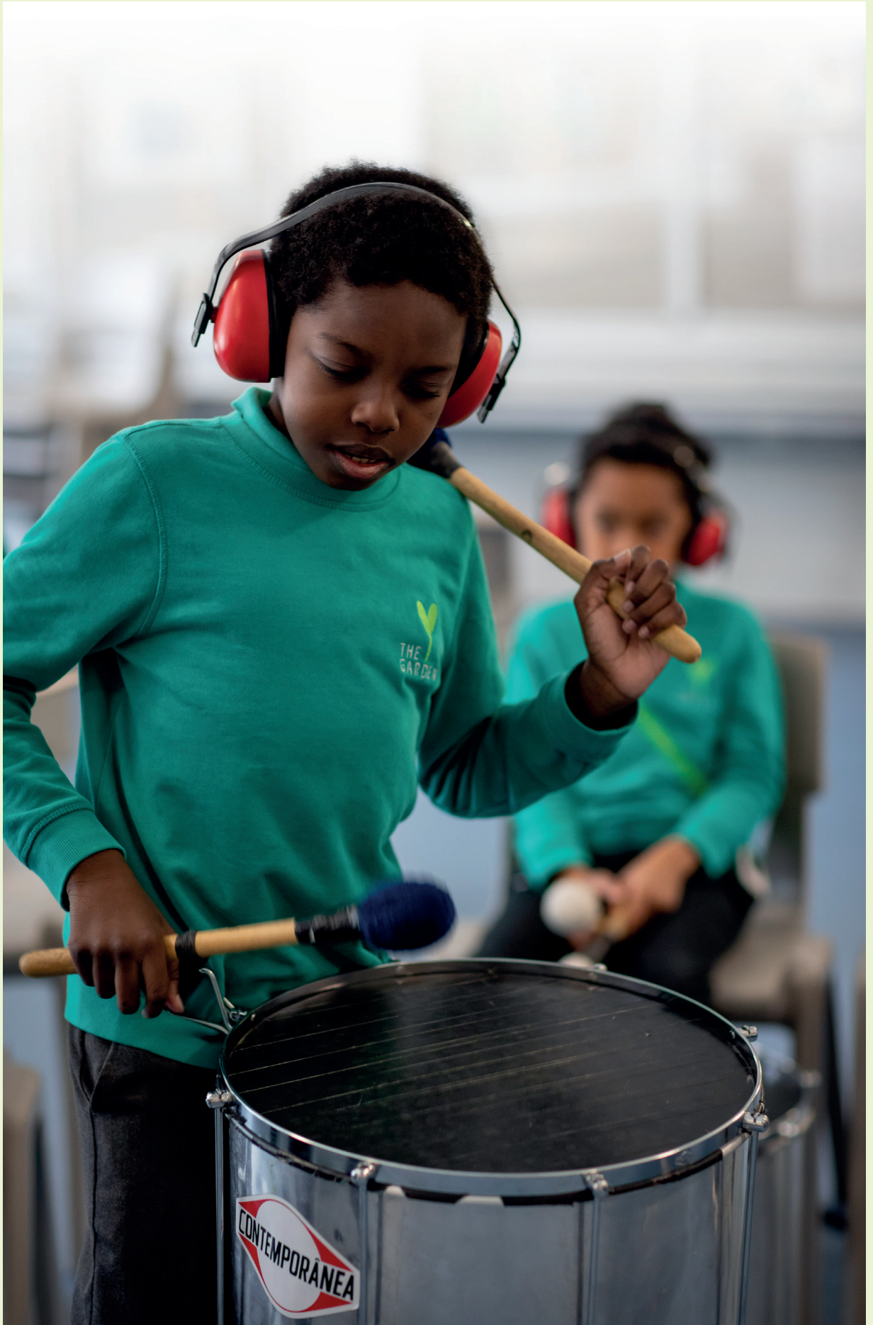
Drum Works at The Garden School, Hackney, part of the Associate Schools programme