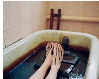
8. Chloe Dewe Mathews, From the series Caspian: The Elements , 2010 Courtesy of the artist