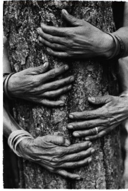
5. Pamela Singh, Chipko Tree Huggers of the Himalayas #74 , 1994