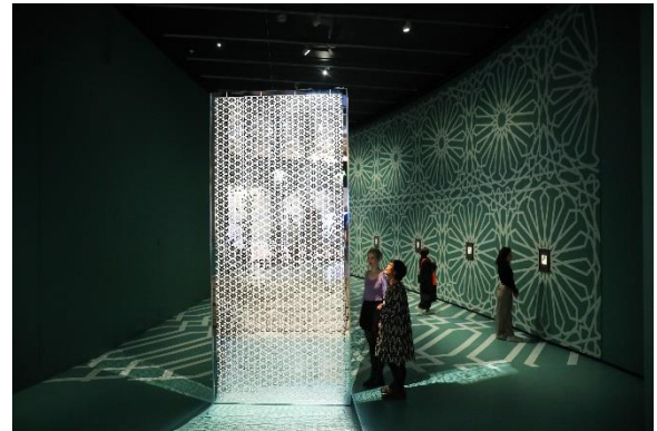
12. Soheila Sokhanvari: Rebel Rebel Installation view Barbican Art Gallery, 2022