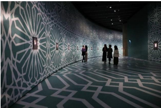
3. Soheila Sokhanvari: Rebel Rebel Installation view Barbican Art Gallery, 2022