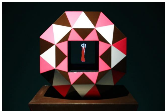
5. Soheila Sokhanvari: Rebel Rebel Installation view Barbican Art Gallery, 2022