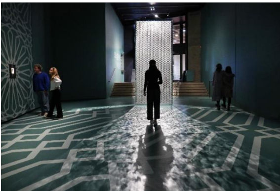
11. Soheila Sokhanvari: Rebel Rebel Installation view Barbican Art Gallery, 2022