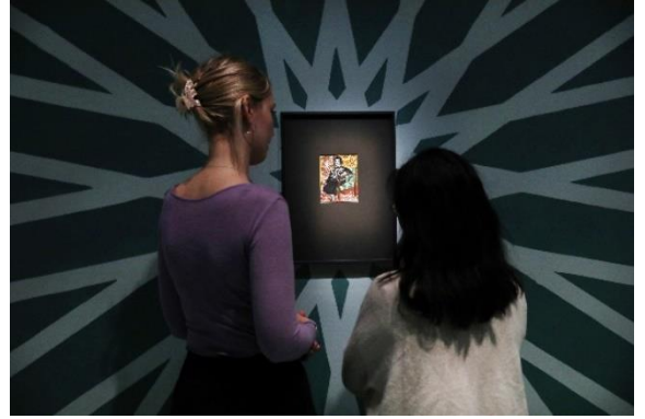
8. Soheila Sokhanvari: Rebel Rebel Installation view Barbican Art Gallery, 2022