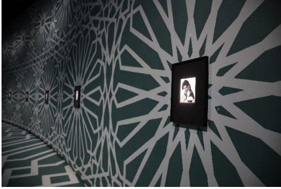
1. Soheila Sokhanvari: Rebel Rebel Installation view Barbican Art Gallery, 2022

PLEASE DOWNLOAD THE IMAGES FROM DROPBOX HERE .