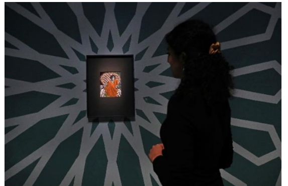
4. Soheila Sokhanvari: Rebel Rebel Installation view Barbican Art Gallery, 2022