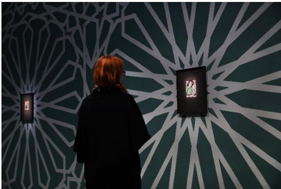
9. Soheila Sokhanvari: Rebel Rebel Installation view Barbican Art Gallery, 2022