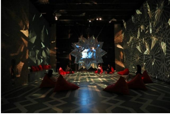
7. Soheila Sokhanvari: Rebel Rebel Installation view Barbican Art Gallery, 2022