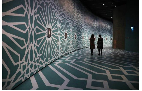
2. Soheila Sokhanvari: Rebel Rebel Installation view Barbican Art Gallery, 2022