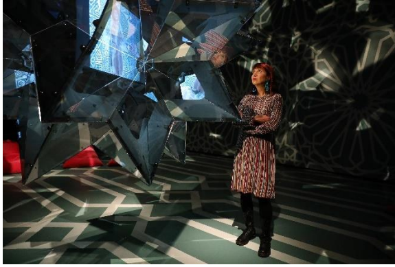
13. Portrait of Artist Soheila Sokhanvari Soheila Sokhanvari: Rebel Rebel Installation view Barbican Art Gallery, 2022