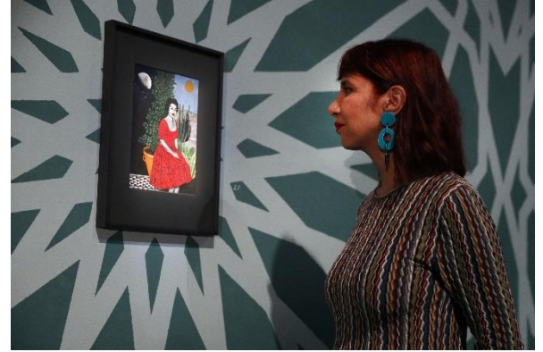
14. Portrait of Artist Soheila Sokhanvari Soheila Sokhanvari: Rebel Rebel Installation view Barbican Art Gallery, 2022